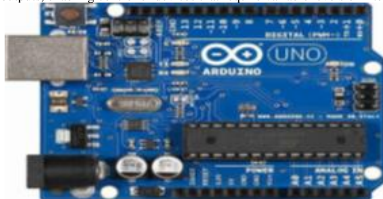
Fig. 4.1 Arduino

One of the key features of Arduino Uno is its ease of use. It comes preloaded with a bootloader, which allows users to easily upload new code to the board without the need for an external programmer. The Arduino IDE (Integrated Development Environment) is used to write and upload code to the board. The IDE is a cross-platform application available for Windows, macOS, and Linux. The digital pins on the Arduino Uno can be configured as either inputs or outputs. This flexibility allows users to interface with various digital devices such as LEDs, buttons, and switches. Additionally, six of the digital pins (3, 5, 6, 9, 10, and 11) can function as Pulse Width Modulation (PWM) outputs, enabling control of devices that require variable levels of intensity or speed.