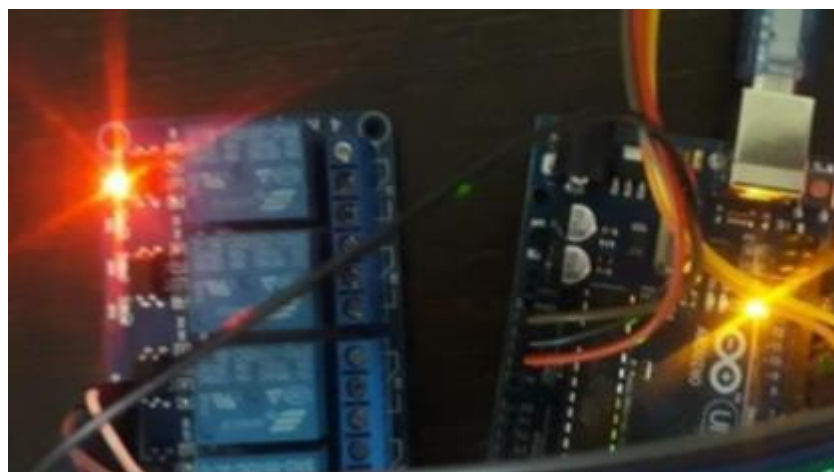
Fig. 5.1 Bluetooth-based home automation Prototype