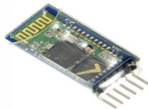
Fig. 4.2 Bluetooth Module

Bluetooth has become an integral part of modern connectivity, providing convenient wireless communication options for a wide range of devices and applications. Its versatility and widespread adoption make it a popular choice for short-range wireless connections.